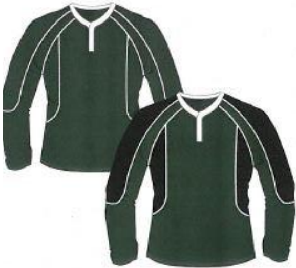
Pro-Tec Reversible Rugby Shirt