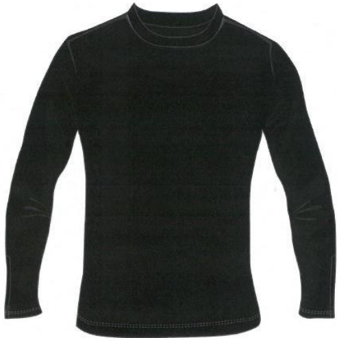
Thermal Base layer