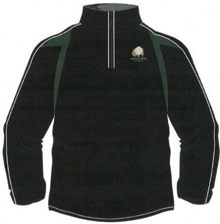
Cuatro Fleece Top