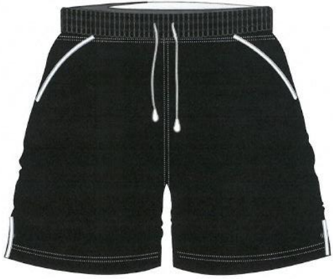
Milan Football Shorts