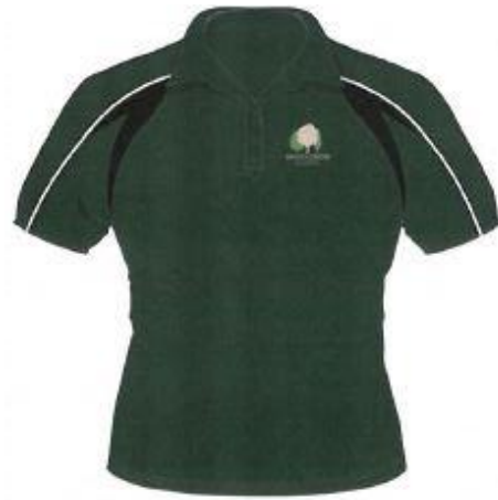
Haze Polo Shirt