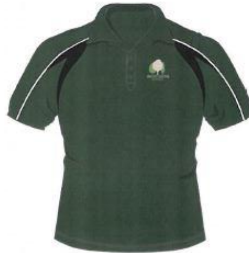
Vapour Polo Shirt